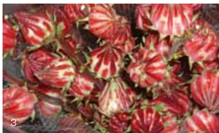
3_hibiscus: Which fertiliser?