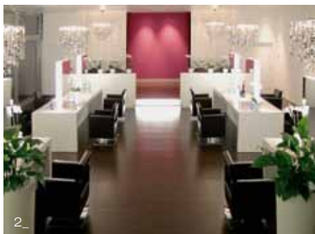
2 - 3_ hairdresser's shop of Marc Hossmann: one picture says more than 1,000 words.