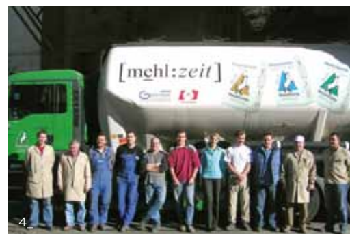
4_Rössel mill: Absorption period reduced by three hours.

However, they also need water. Over ten years ago, the first bakers and confectioners began to experiment with the Grander revitalized water system. Bakers from Austria, Switzerland, Germany, and Italy have raved about the more delicious taste and an improved wholesomeness. “The dough absorbs more water, is silkier, the dough fermentation is better and quicker despite a reduced yeast addition. The bread becomes light and creamy, spicier, more delicate; the crust is softer and the pastries are wholesome. Furthermore, it remains fresh for a longer time”, detail the bakers of their experiences with Grander. Especially with the organic pastries, the experts are convinced that the sourdough achieves a more beautiful and quicker ripening, and the wholemeal bread remains softer longer using the better water. The baker school in Baden close to Vienna has arrived at the same conclusion after a comprehensive experiment, showing indeed scientific character. The rule of thumb for every baker is the same anywhere, two parts of flour and one part of water. With the combination of first-class flour and first-class water, one achieves distinguished products, without any additives. “Grander for me means also another quality of life”, explains (representatively for all his colleagues) master baker Rainer Knoll from Bremen.